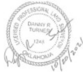
Exhibit "A" LAND DESCRIPTION Tract 25

A part of the Northwest Quarter of Section Twenty-two (22), Township Sixteen (16) North, Range One (1) East of the Indian Meridian, Logan County, Oklahoma, as shown by attached "Exhibit B" and being more particularly described as follows: